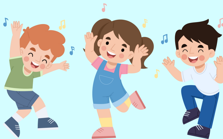
Lots of dancing!