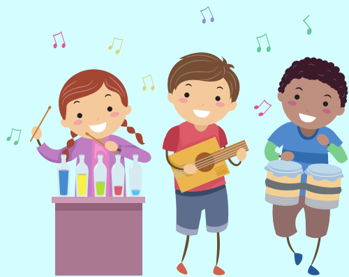
Musical Instrument exploration