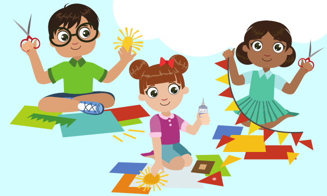
Art & Craft